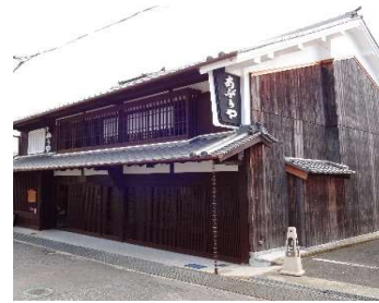
②Historic Inn 'Aburaya' The 300 year-old historic inn remains exactly as it used to be in Edo period.