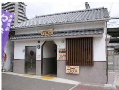
①Tourist Information 'Uda-Midokoro'