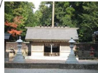
③Udana Mikumari Shrine